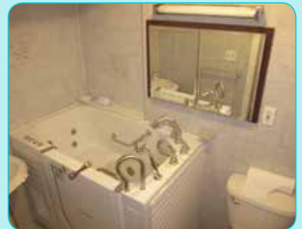
BEFORE AND AFTER: AN EMOD JOB RECENTLY COMPLETED BY HAMASPIK OF KINGS COUNTY'S ACCESS TO HOME PROGRAM