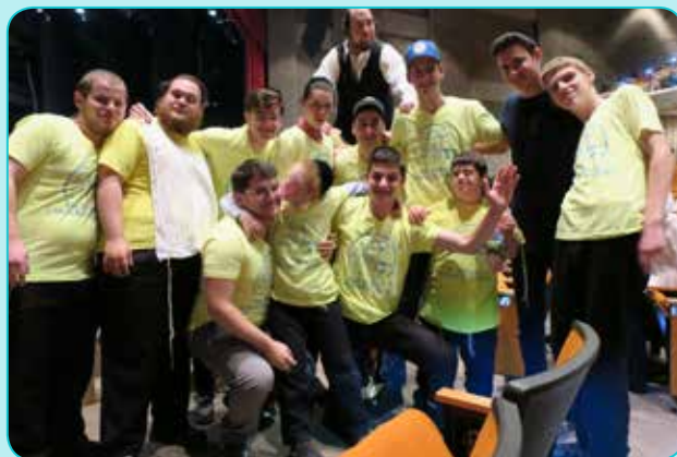
CENTER OF ATTENTION: LAKEWOOD'S VOLUNTEERS REVEL WITH HAMASPIK'S SPECIAL FRIENDS