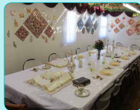
ON THE TABLE: SOUTH 9TH'S SPREAD (LEFT); CONCORD'S REGAL REPAST (CENTER); THE ARCADIAN IRA'S SUKKAH (RIGHT)