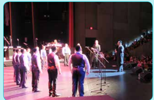
GRAND FINALE: YIDDISHE NACHAS THRILLS THE CAPACITY CROWD