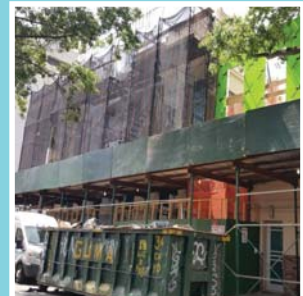
UNDER WRAPS, FROM THE TOP DOWN: Construction at 1402 14th Ave.