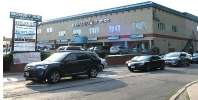
AT THE HEART OF A COMMUNITY: Hamaspik's Rockland County headquarters facility, centrally located in the heart of Monsey on Rt. 59, was the site of an empowerment event touching the heart of the community

For more information about Sparks of Life, please leave message at 732-806-1133—all calls strictly confidential. For more information about HamaspikCare, call 1-855-HAMASPIK.