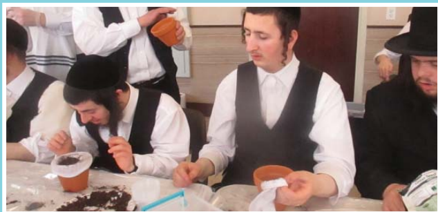
MANUAL LABOR OF LOVE: Hamaspiik of Orange County Day's "boys" are all hands-on come Shavuos