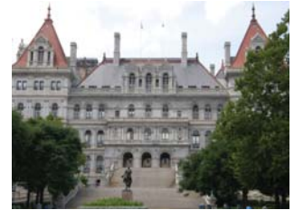
WHERE CHANGE HAPPENS: Albany's Capitol building

the regulations—which would go into effect immediately—would make New York the first U.S. state with its own "Ten Benefits"—in effect, an ACA of its own regardless of what happens in Washington. ★