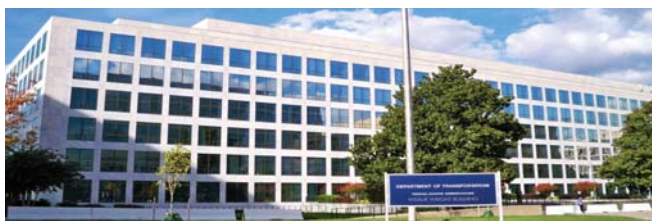
UP WITH COMPLAINTS: Department of Transportation Headquarters.

According to a 2012 survey done by Autism Speaks, the New York-based autism advocacy organization, 49 percent of parents of a child with autism spectrum disorder (ASD) reported that the child attempted to wander or run away at least once after age four. ★