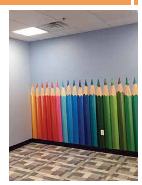
MAKING A POINT: ART IS FUN HERE!