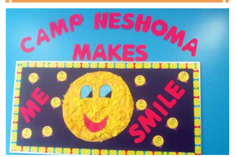
HAPPY IS HERE: THIS VINTAGE 2013-SEASON CAMP NESHOMA PHOTO SAYS IT ALL