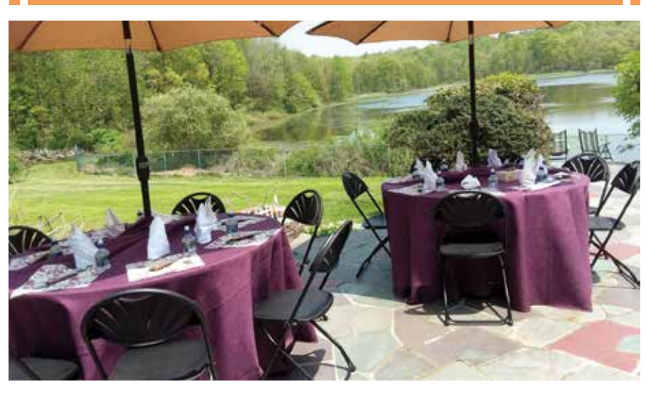
JUST THE RIGHT SHADE: A LOVINGLY-CATERED OUTOOR LUNCH AT SHNOIS CHAIM