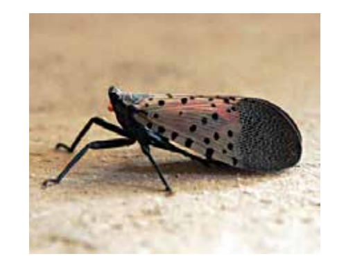
SEEN ME? WATCH FOR LANTERNFLIES

Albany, NY — The New York State Dept. of Environmental Conservation (DEC) recently asked the public to keep an eye out for spotted lanternflies, an