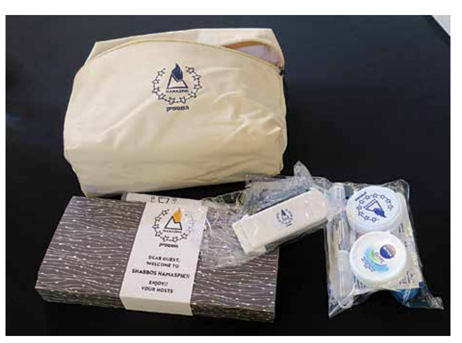
A COMPLETE PACKAGE: HOUSEWARMING KITS TO MAKE EACH GUEST FEEL AT HOME