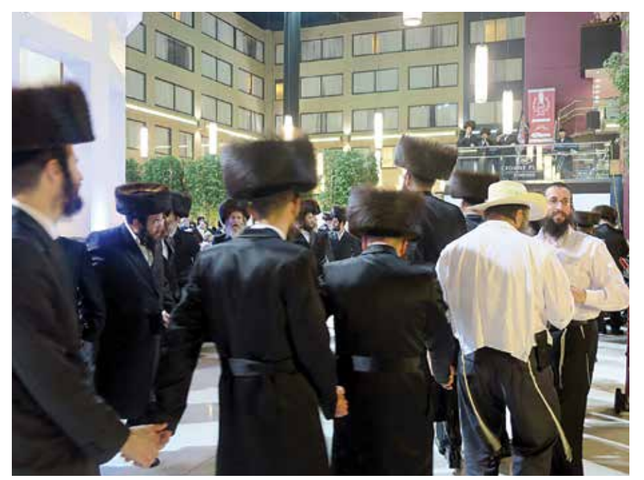
PUTTING FEET TO THE BEAT: THE MENFOLK SWAY AS A ROLLICKING BAND PLAYS

Over 300 fathers and mothers, parents of children with special needs all, arrived at the Crowne Plaza Hotel in Stamford, Connecticut the early afternoon of this past Friday, June 8.