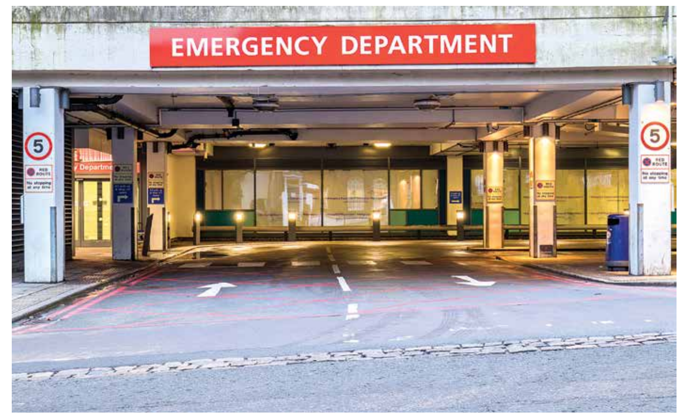
SAME NUMBER OF PATIENTS, SKYROCKETING COSTS: GOING HERE IS GETTING MORE SERIOUS—AND SERIOUSLY COSTLIER, TOO

In the meantime, in most states where staffing legislation exists, policymakers have forged compromise between nurses and hospitals.