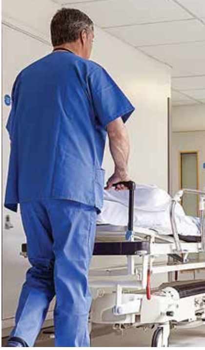
ROLLBACK: LESS PATIENTS PER NURSE

The debate is over nurse-to-patient ratios—with nurses calling for years