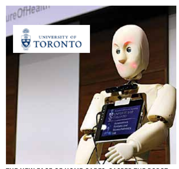
THE NEW FACE OF HOME CARE? CASPER THE ROBOT

For example, University of South Florida (USF) researchers attending the convention have been studying seniors at The Villages retirement complex, where homes have been outfitted with electronic sensors to trace residents' movements and use of appliances, chairs, beds, and bathrooms. Caregivers and even family members in other states can monitor them and be alerted to things like falls or changing sleeping, eating or bathroom habits.