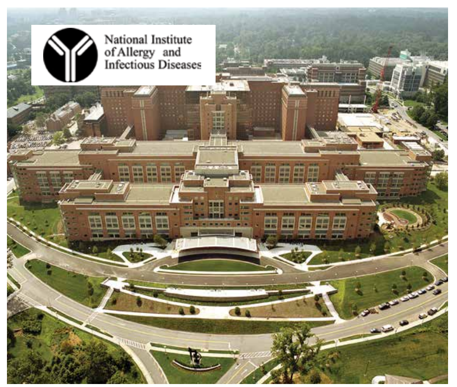
SKIN IN THE GAME: THE NIH'S HQ IN BETHESDA, HOME TO NEW ECZEMA RESEARCH

The research, published recently in JCI Insight , found that six of the ten adults and four of the five children had over 50 percent improvement in their atopic dermatitis.