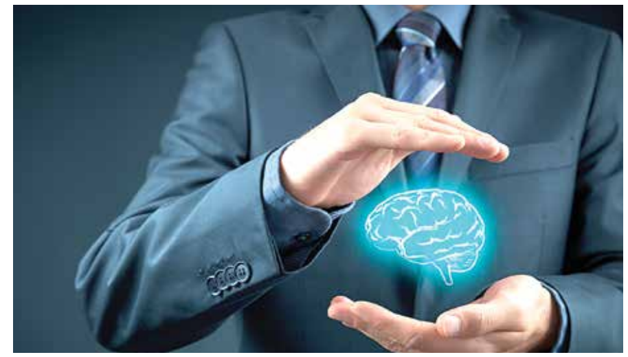
BRAIN GYM: SCIENTISTS HAVE LINKED MEDITATION, BREATHING WITH BRAIN FOCUS

and measured pupil dilations of study participants while they performed mental tasks that required great focus. At the same time, they monitored participants' breathing, reaction time and brain activity in the locus coerulus.