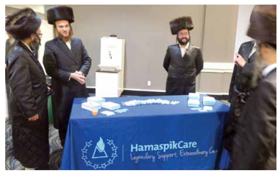
HAMASPIKCARE CARES: HOME-CARE STAFF ON HAND TO ANSWER QUESTIONS

They were perhaps physically hungry. But as they ate, exchanged heartfelt goodbyes, checked out and headed home, they did so feeling spiritually fueled for a newly-hopeful 12 months... until the next Shabbaton.