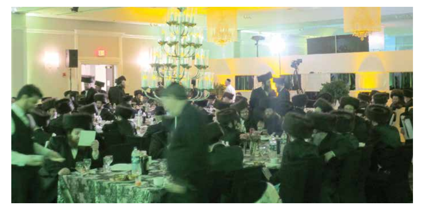
FOOD FOR THOUGHT: THE CAPACITY CROWD GATHERED FOR THE UPLIFTING 'MELAVEH MALKA' MEAL