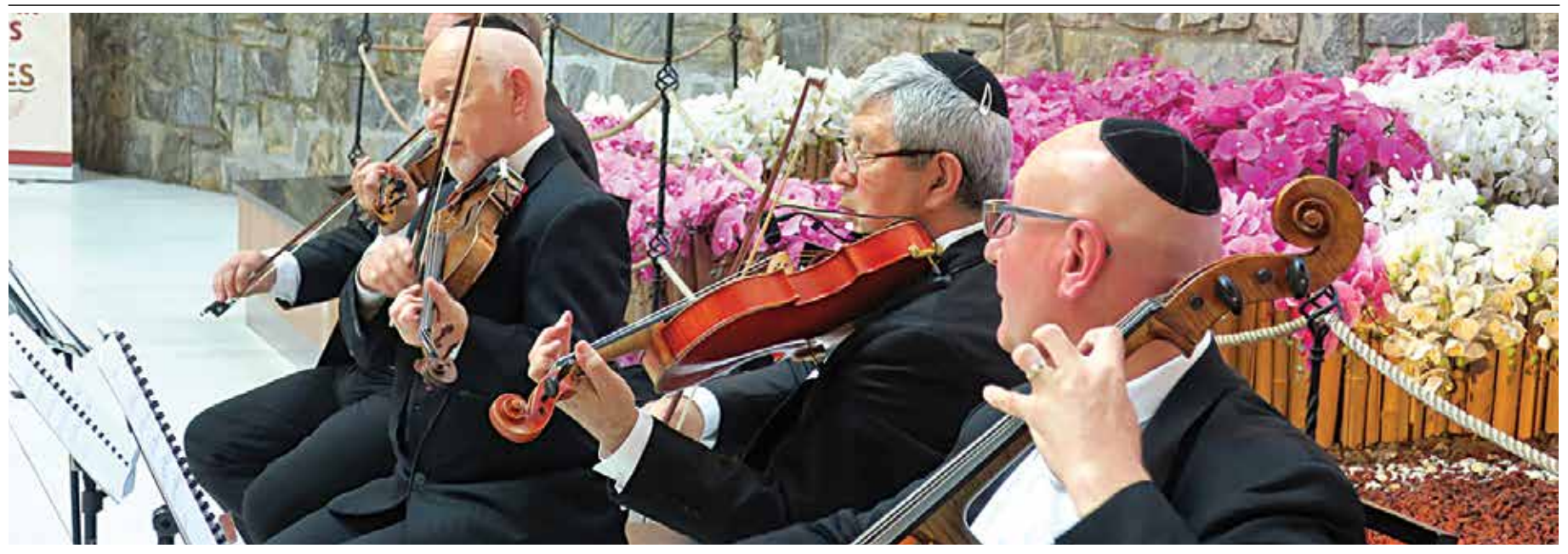
THE SOUND OF SUPPORT: PROFESSIONAL MUSICIANS SET THE PRE-SHABBOS TONE

Hamaspik Hosts Its Ever-Popular Annual Shabbaton Parental Getaway